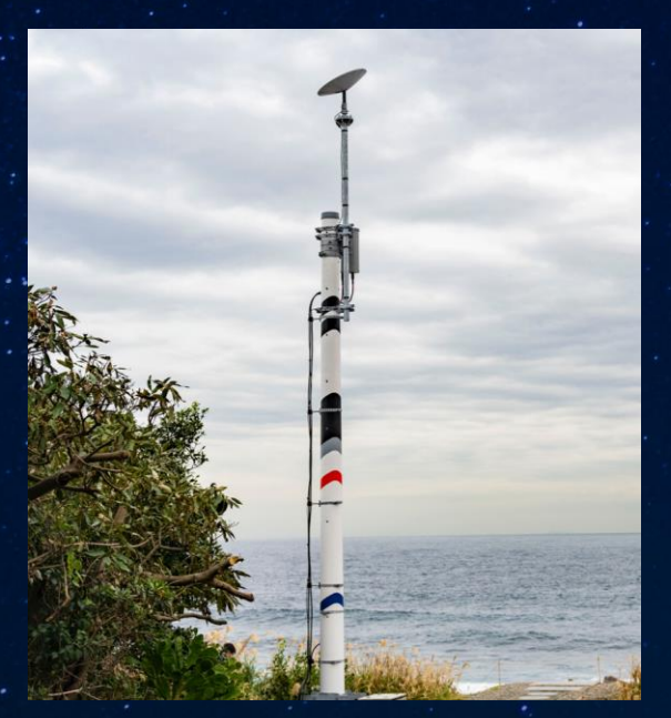
First Starlink Backhaul Agreement in the World