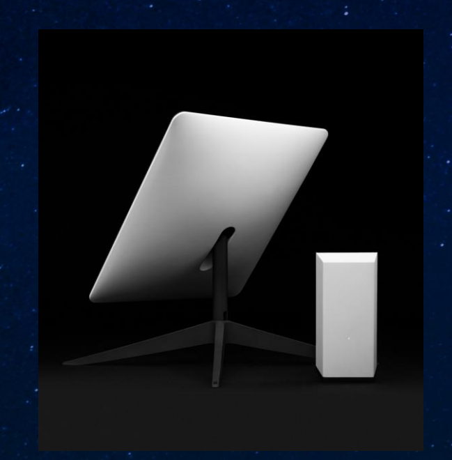
First Starlink Reseller in Japan